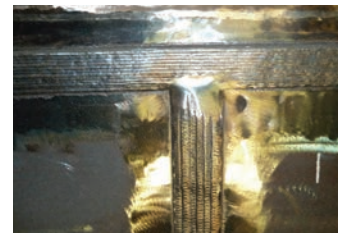
Seam crack repair and reinforcement band