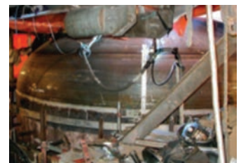
Weld overlay for build up and material upgrading