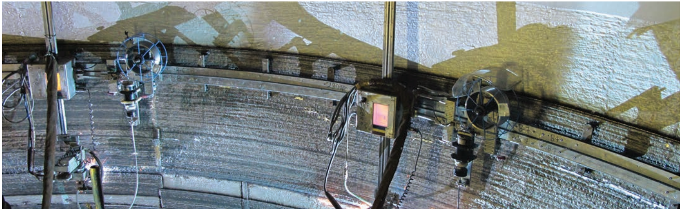
Structural reinforcement of a Delayed Coker Unit