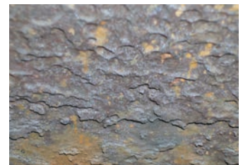
ID cladding defects, CUI, corrosion and cone erosion