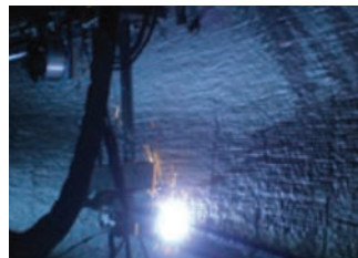
Bulge repair and structural reinforcement