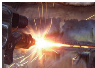
Cone and head removal, repair and reinforcement